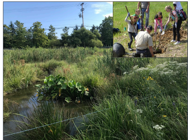
Figure 1. The WWHS project transformed an old pond into a thriving wetland ecosystem. Inset photo: Girl scouts and other volunteers plant trees to buffer the wetland.

After approval of the Piney Creek watershed-based plan in 2012, the Piney Creek Watershed Association (PCWA) began working on rain gardens and a land stabilization project. PCWA identified the WWHS project as a way to reduce bacterial contamination and sediment loads in Cranberry Creek while teaching students and the community about stream restoration, water quality, and the importance of wetlands.