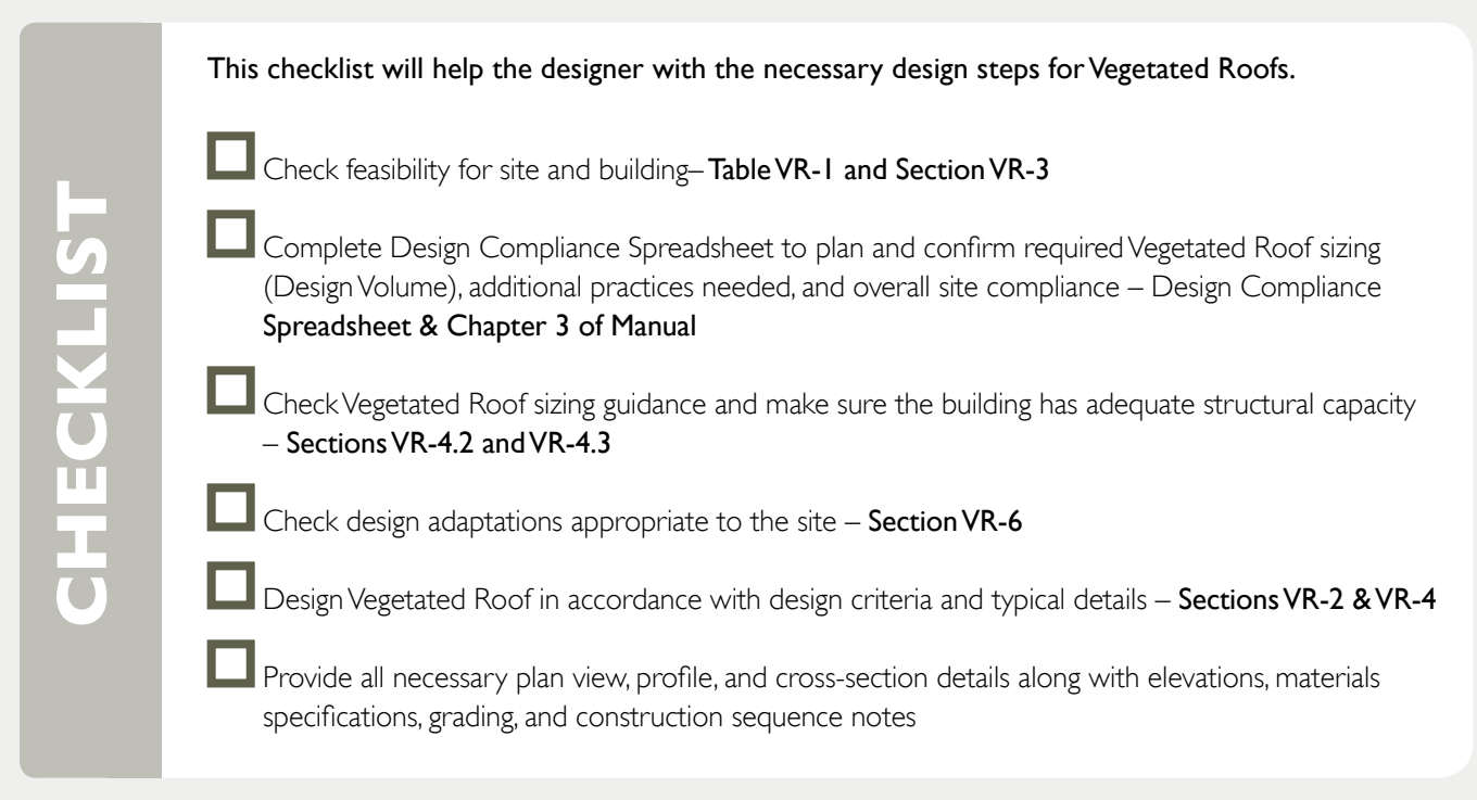
Table VR-3. Vegetated Roof Design Checklist