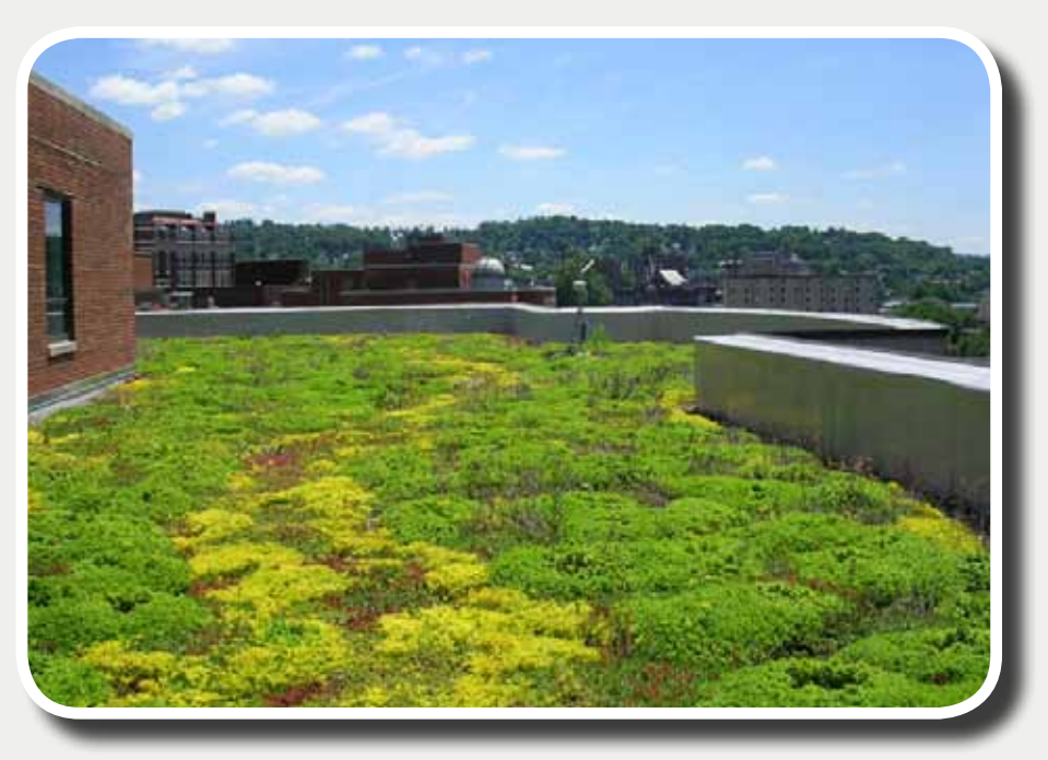
Extensive Vegetated Roof

Figure VR-1. Example Applications of Vegetated Roofs