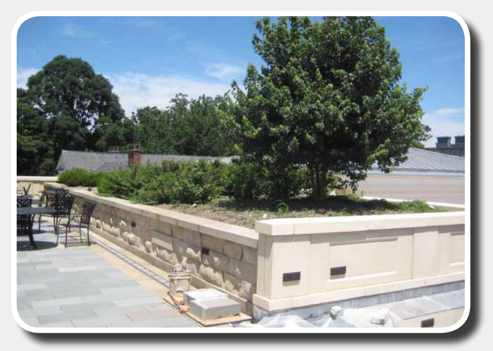
Intensive Vegetated Roof