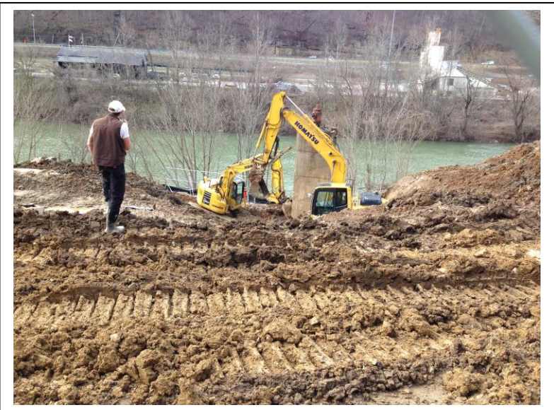
Figure 2: Soil found to contain MCHM in trench area being stockpiled to left of excavator