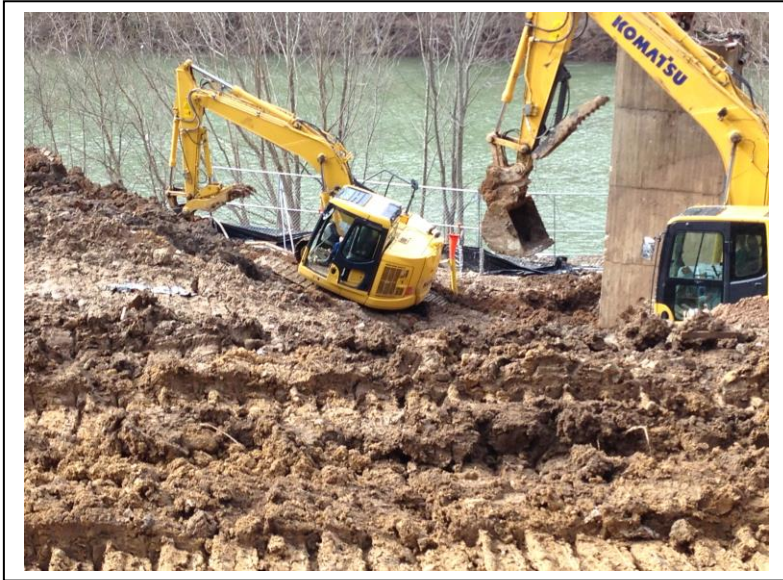
Figure 1: Equipment working in lower trench area