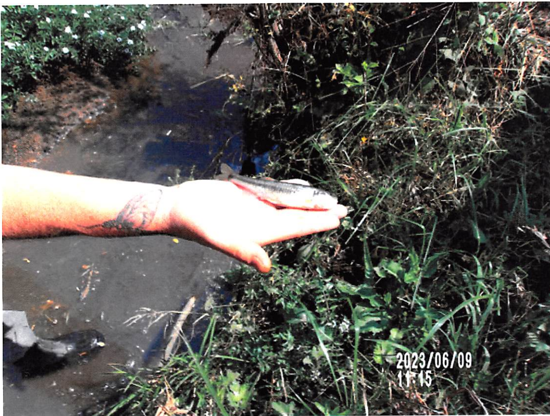
Dead fish downstream of the storm drain.