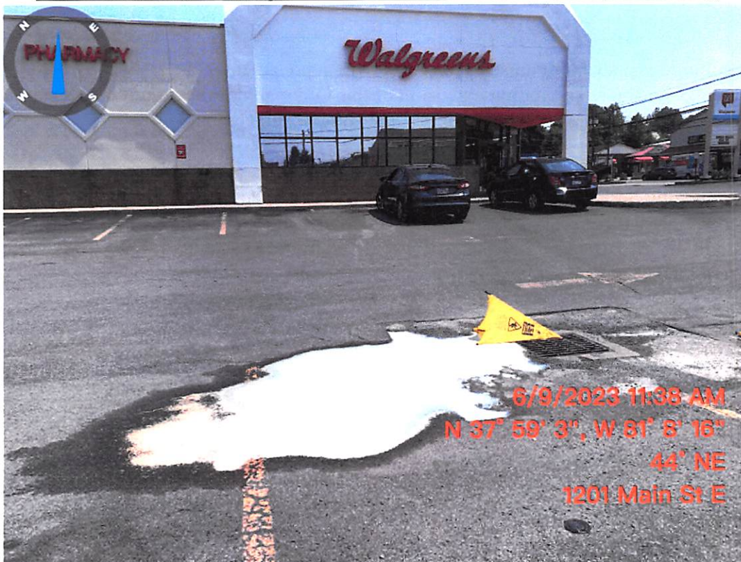
Industrial waste dumped near the stormwater drop inlet in a Walgreens parking lot.

S&E Commercial Cleaning LLC - 10-33568 - June 9, 2023 - Fayette County