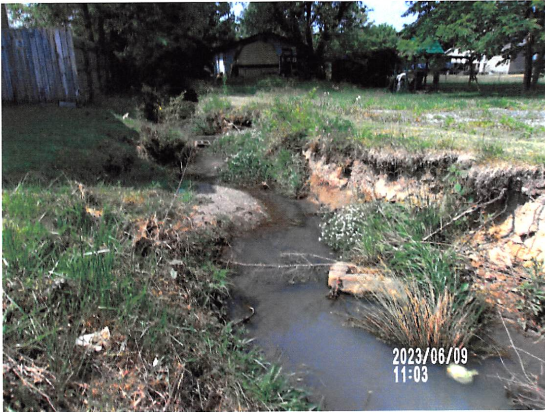
CNA downstream of the storm drain.

S&E Commercial Cleaning LLC - 10-33568 - June 9, 2023 - Fayette County