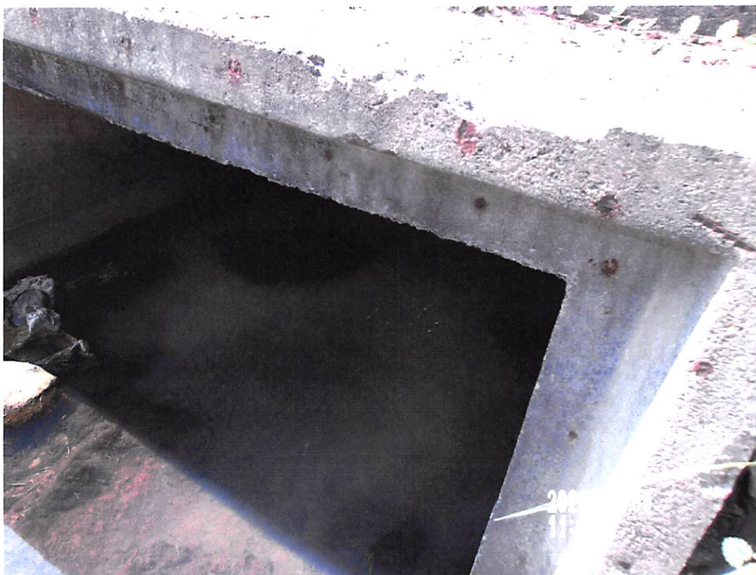
Conditions not allowable (CNA) where the drop inlet enters the stream.