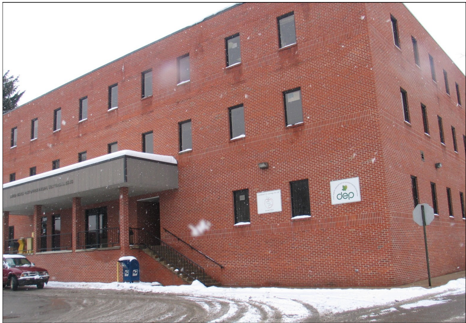
The DEP's Philippi office shares this three-story building with the U.S. Postal Service and the Barbour County Board of Education. Most of the DEP personnel are on the third floor.

DEP staffers here have been battling space