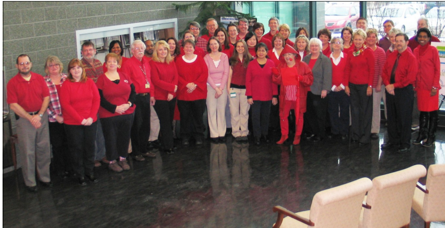
DEP employees gathered in the Kanawha City headquarters to show off their red.