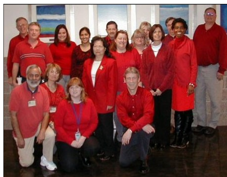
Division of Water and Waste Management employees gather for a red group shot.