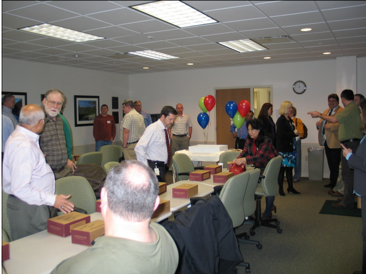
The Department of Environmental Protection hosted a reception for DEP staff, consulting engineers, accountants and other state officials associated with the Clean Water State Revolving Fund. With the help of federal stimulus money, 39 projects were funded in 2009 through the CWSRF.