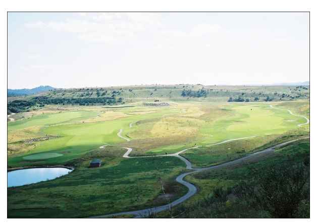
Twisted Gun Golf Course is constructed on a reclaimed surface mine in Mingo County.

Callaghan said a key component of West Vir-