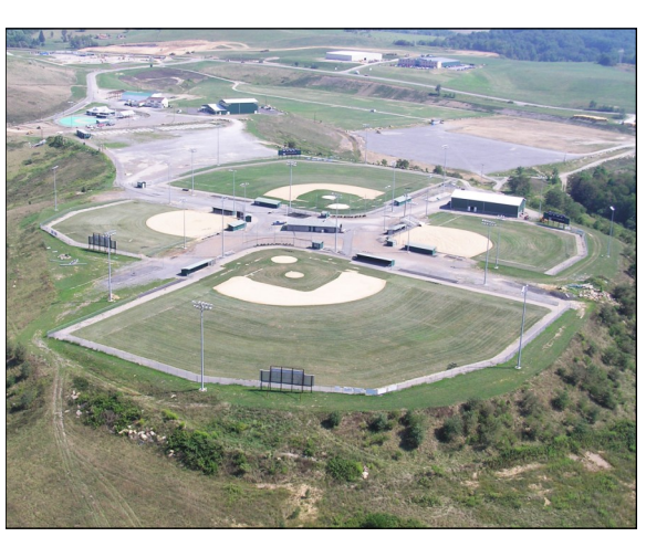
The award-winning Mylan Park, not far from downtown Morgantown, was built on a reclaimed surface coal mine.