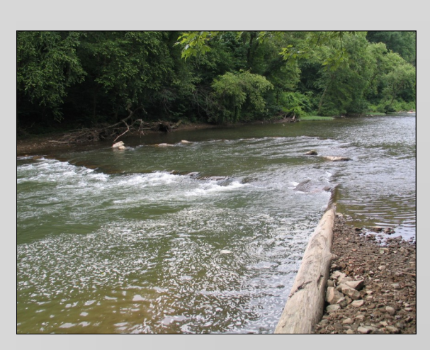
The cross vane design of the restoration structures on the Little Coal narrows the river and speeds up current.

The DEP has been a driving force behind a major restoration project on the Little Coal that took root some 30 years ago. That's when the