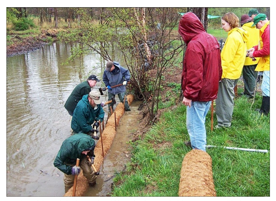
Members of the Berkeley Springs-based Sleepy Creek Watershed Association install biologs.