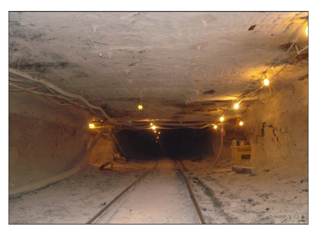
The mantrip ride from the shaft elevator to the face of the longwall operation took close to an hour on these tracks.

I experienced something that very few people, who are not coal miners, get to experi-