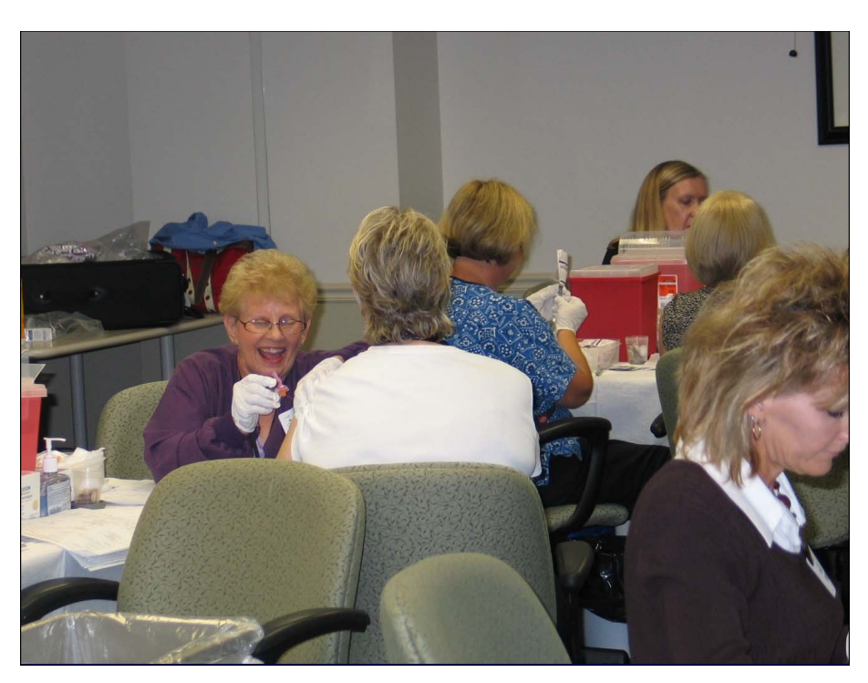
DEP employees lined up for seasonal flu shots offered at the agency headquarters in September. The vaccine, however, does not protect people from the H1N1 virus, or swine flu.