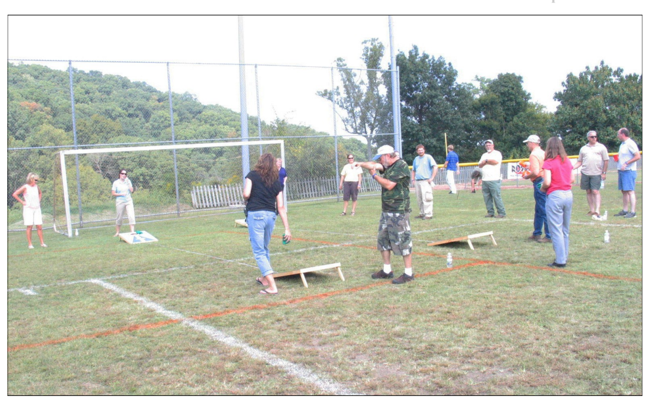
Cornhole competition was popular during the Employee Recognition Event at Little Creek Park in South Charleston.