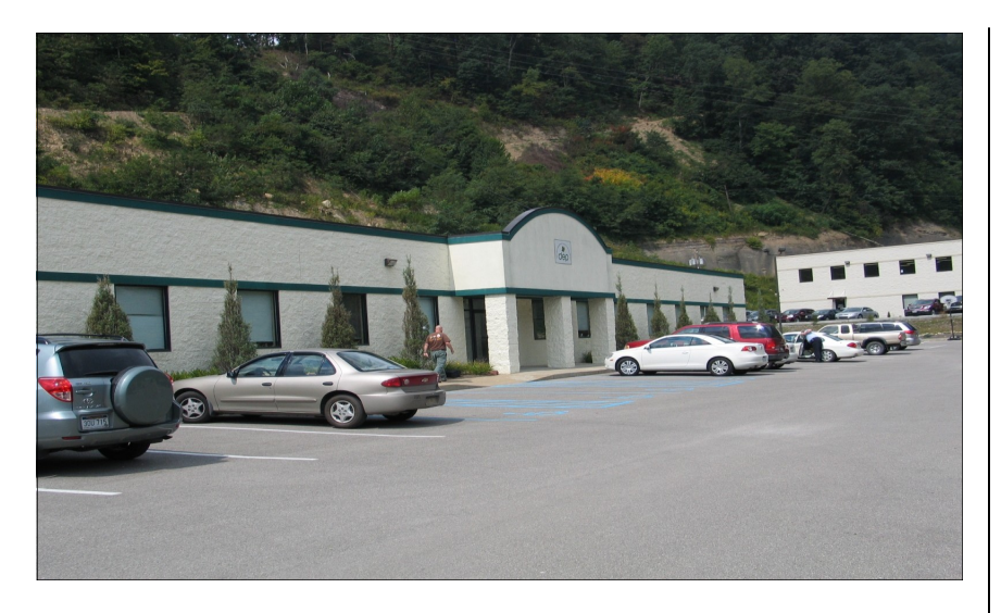
The DEP's Division of Mining and Reclamation office in Logan employs about 60 people when fully staffed. The 5-year-old building has 13,000 square feet of space.