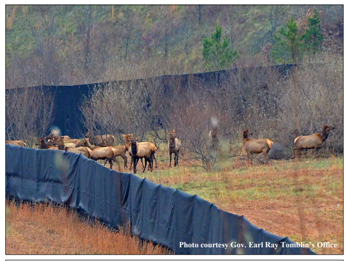
On Dec. 19, the first 24 members of the elk reintroduction plan were displayed for the media and curious onlookers. Eventually, more than 50 additional elk will be released into the wild in southern West Virginia, marking the elk's return to the state after a 140-year absence.

the making and involved several Lakes National Recreation Area, the Rocky Mountain Elk Foundation, the Conservation Fund, and the National Fish and Wildlife Foundation.