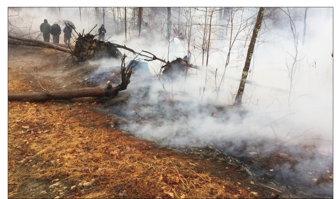
Smoke from the Brocum Run underground mine fire in Preston County rises from a crack in the ground on Dec. 6. Inspectors from the DEP's Office of Abandoned Mine Lands and Reclamation and the federal Office of Surface Mining surveyed the site and are currently working on a plan to put the fire out.

For more on the Brocum Run fire, check out the next edition of the <u>DEP's</u> <u>TV show, "Environment Matters."</u>