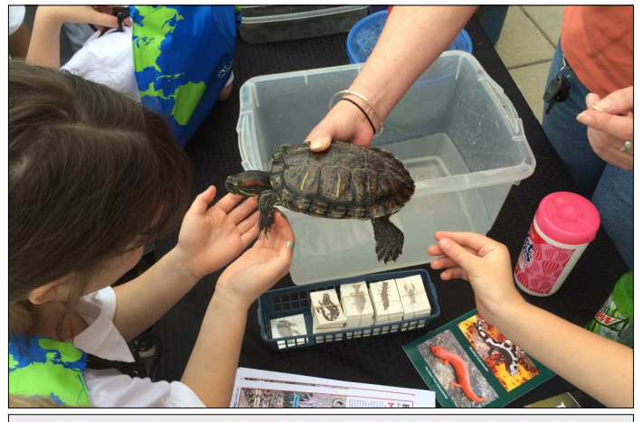
Students got a hands-on experience at the DEP's Make It Shine Earth Day celebration at the Clay Center on April 21. The students could hold turtles, salamanders, pet snakes, and see the fish of West Virginia up close - all while learning how they interact with each other in a delicate ecosystem.

Students could learn from the DEP's Watershed Improvement Branch, Watershed Assessment Branch, Rehabilitation Environmental Action Plan, the Division of Air Quality, and the Homeland Security and