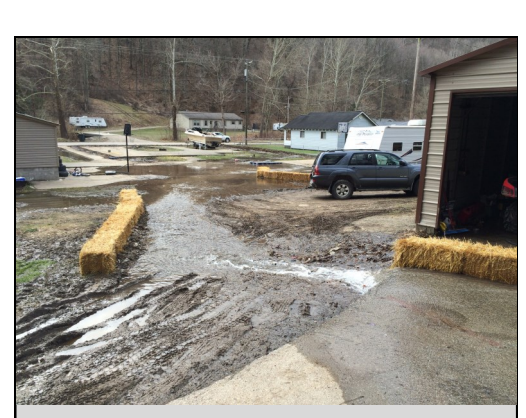
Water flows from an abandoned mine into a yard on Hughes Creek in Kanawha County. Hay bales were placed to control the flow of water and debris.

The water could be seen bubbling out of a nearby hillside and out of the ground, but its source is still uncertain.