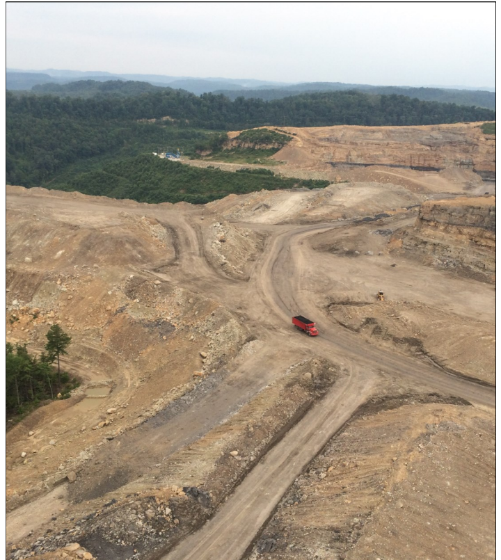
It might have taken several days to inspect a surface mine site as large as this one, but aerial tours cut that time to hours. Once an issue is identified by air, a follow-up ground inspection could follow.