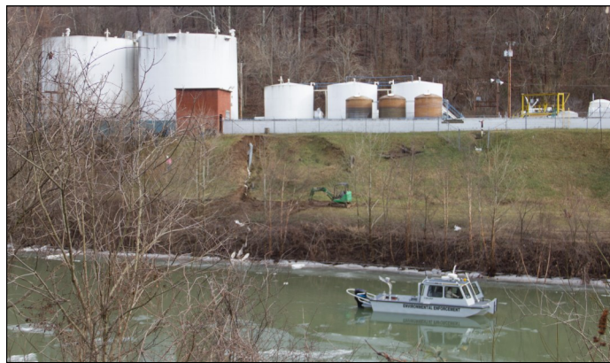
The DEP's Environmental Enforcement boat patrolled the Elk River below the Freedom Industries site in the days following the Jan. 9, 2014, spill.

Originally, Freedom had only $150,000 set aside to pay for reclama-