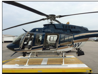
The state of West Virginia's Bell 407 helicopter can carry one pilot and up to five passengers.

Flying the helicopter was Steve Knotts, a State Police retiree and pilot with approximately 13,000 hours of flight time.