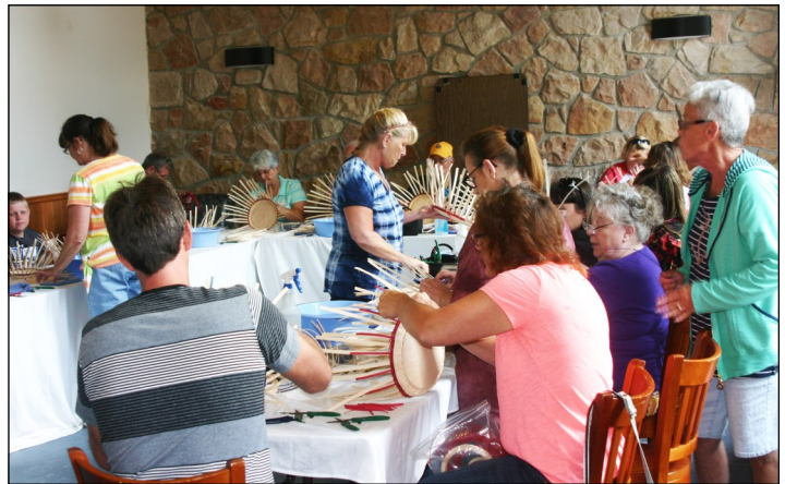
During the Adopt-A-Highway Volunteer Appreciation Day at Canaan Valley, attendees also got to take part in a basket weaving class.