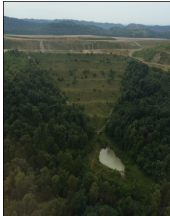
Aerial inspections allow DEP to see entire projects that can't be seen completely from the ground.