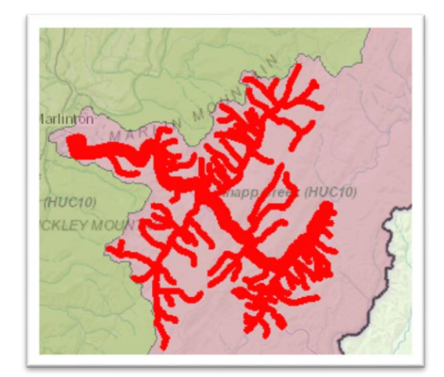
Marlinton's source water protection area on Knapp Creek overlaps with the WBP.