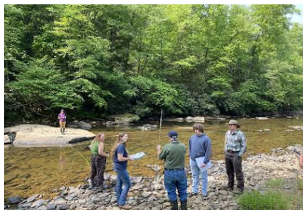
Figure 9. The Envirothon winning team received aquatics training from WIB staff in preparation for the national competition.