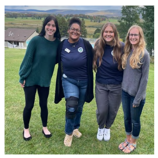
Figure 10. WIB's Stream Partner Program VISTAs.

In 2023, a VISTA program was created to support watershed groups and the Stream Partners Program housed in the WV DEP's Watershed Improvement Program. The goal is to increase environmental stewardship, community revitalization and organizational capacity to selected watershed groups across the state.