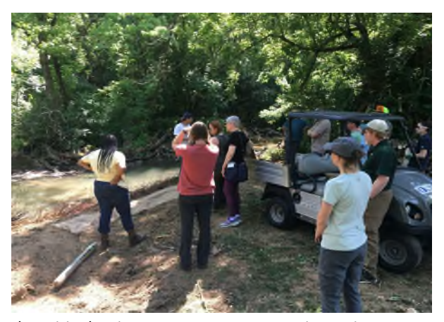
Figure 5 . In May 2023, the Tuscarora Creek Project Team attendees visited an in-progress stream restoration project on Tuscarora Creek, funded through §319 and other sources.