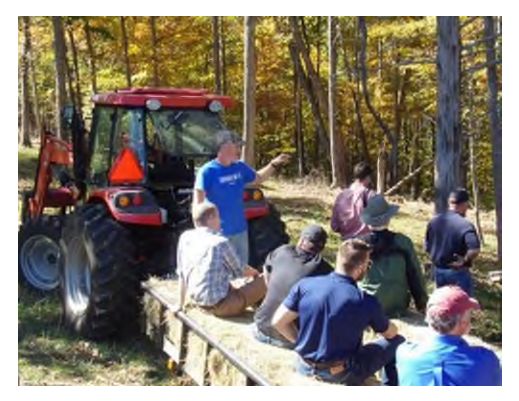
Figure 4. Photo from one of many field days held across the state. Here participants listening to experts in forestry management in the Greenbrier Valley Conservation District.

The <u>WV Conservation Agency</u> (WVCA) remains the primary entity responsible for the implementation of the West Virginia agriculture and construction components of §319 Nonpoint Source (NPS) Program and for coordinating and implementing water quality improvement projects statewide. The WVCA develops WBPs in priority watersheds and in most cases WVCA's conservation specialists act as project managers for §319 projects within their districts. WVCA also provides a wide variety of technical information and assistance to landowners, state and federal agencies, watershed groups, conservation districts, and others in the selection of Best Management Practices (BMPs) to protect the natural resources of the state. WVCA is governed by the State Conservation Committee (SCC).