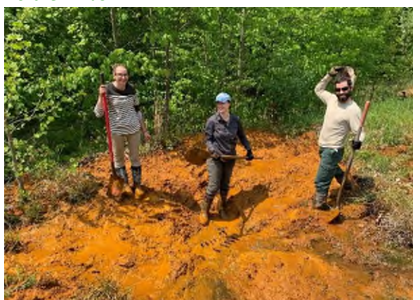
Figure 6. FODC works hard to maintain one of many acid mine drainage (AMD) treatment sites.