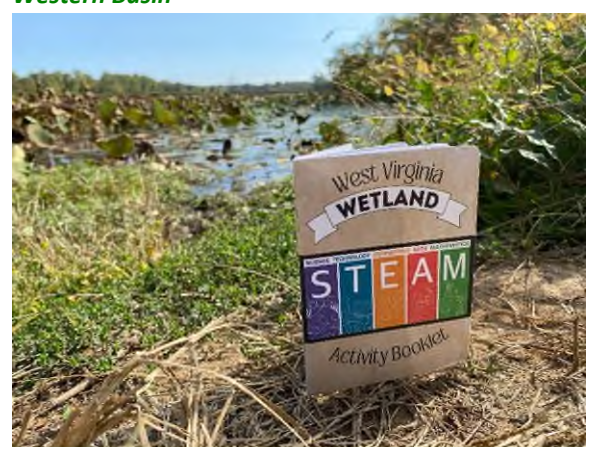
Figure 8. One of many WV wild wonderful wetlands.