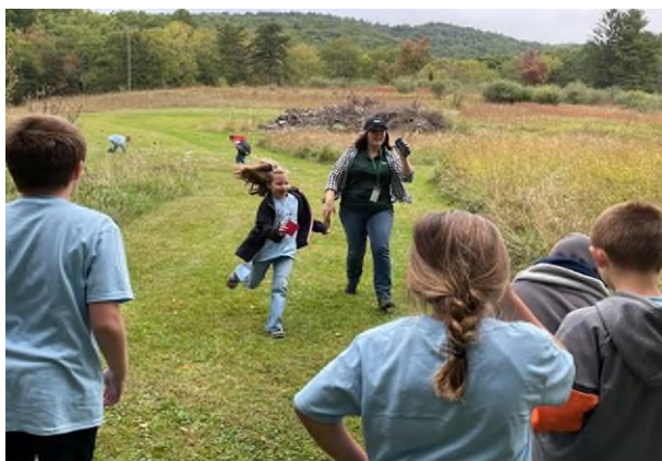
Figure 7. The SBC is leading an activity at the 2023 Water Celebration Day held at Moncove Lake State Park.