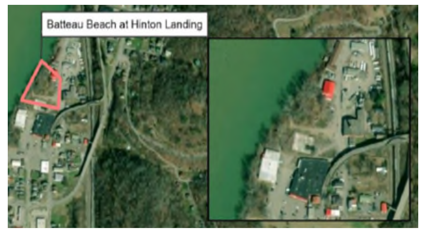
Figure 3. A portion of the Hinton map showing the one of many potential GI project sites.

We are seeing an increased interest in green infrastructure (GI) and creative stormwater implementation. A major effort occurred in the upper New River basin focused on the riverside city of Hinton. We are coordinating with this small community to develop conceptual designs, which will eventually move towards implementation. A summary of this report begins on page-21 and the full report is available upon request.