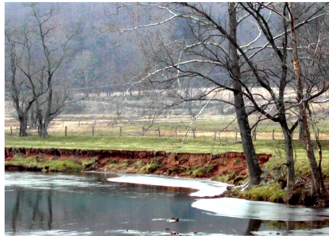
The Lost River Eroding Stream Banks

In 1998 a TMLD for fecal coliform was written for the Lost River citing three major non-point source categories: forestland, pastureland, and cropland. Beginning in 1996, significant funding has been dedicated to the Lost River watershed to address water quality concerns. The USDA-NRCS PL-534 project was able to provide $1,763,906, with 40% of this cost, $705,562, coming from the landowner. This funding has gone towards the installation of manure storage for the agriculture producers as well as the relocation of feedlots and installation of alternative watering sources. This effort has been of tremendous assistance to the agricultural producers in the watershed. Though substantial effort has been taken to improve the water quality of the Lost River, there are still many landowners who need additional assistance to reduce agricultural