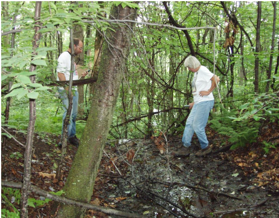
Pre-application meeting with Corps, Deckers Creek, Preston County