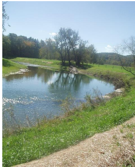
Stream restoration Knapps Creek, Pocahontas County

WV Department of Environmental Protection Division of Water and Waste Management 601 – 57 th Street, SE Charleston, WV 25304 (304) 926-0495