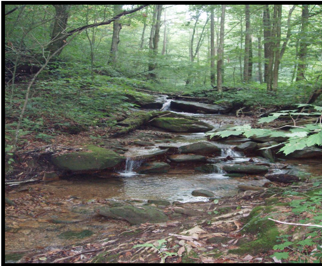
Long Branch of Paint Creek, Kanawha County

This guide is not intended to replace any West Virginia regulation or related federal requirements. Additional permits, licenses, variances, or similar authorizations may be required by other federal, state, or local laws not addressed in this booklet. All applicants should read and follow pertinent, current regulations when applying for any permit. It is important to note that multiple permits may be required for a single project.