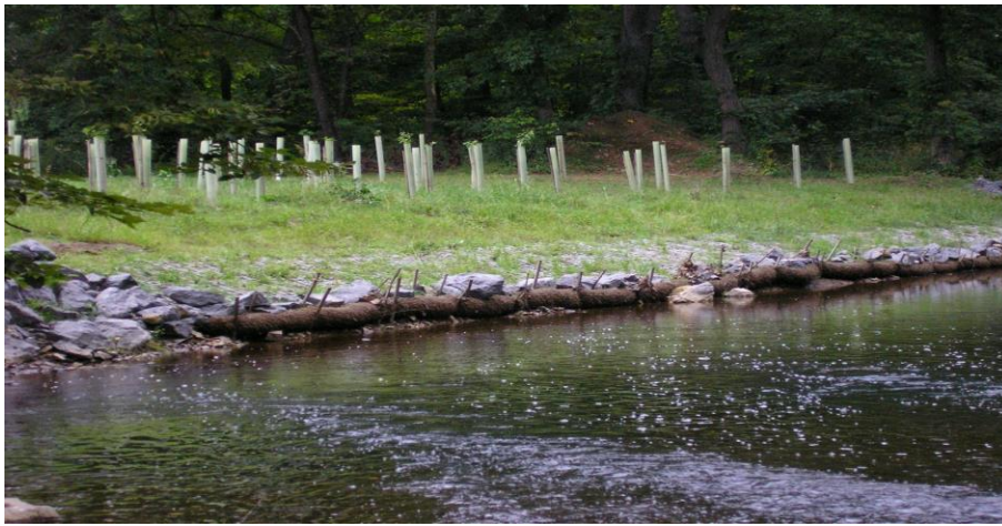
Riparian restoration and streambank repair on Sleepy Creek, Morgan County

WV Department of Environmental Protection Division of Water and Waste Management 601 – 57 th Street, SE Charleston, WV 25304 (304) 926-0495