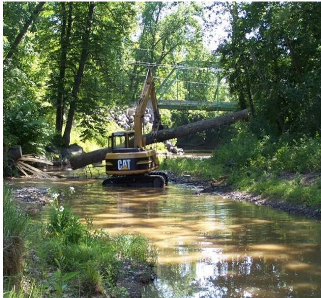
Contractor's work along Sleepy Creek, Morgan County

Office of Land and Streams Building 74, Room 200 324 Fourth Avenue South Charleston, WV 25303 Phone: (304) 558-3225 Fax: (304) 558-6048