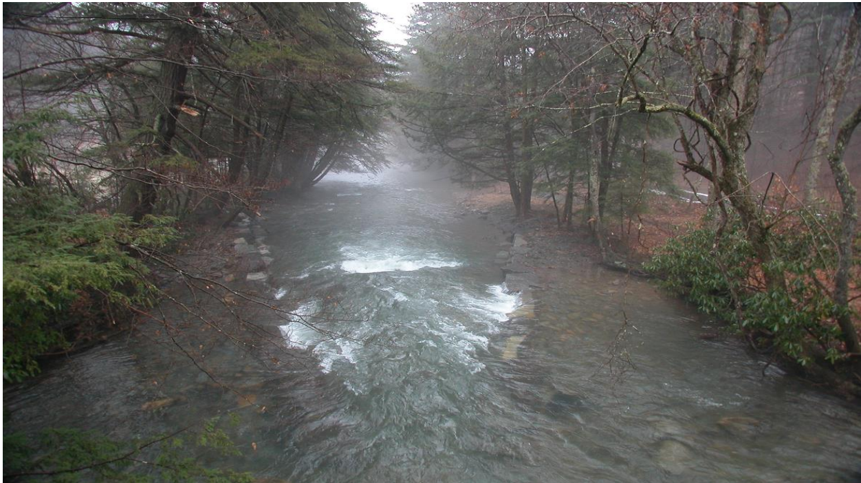
Bankfull flow over cross vane and step pool in Horseshoe Run, Tucker County