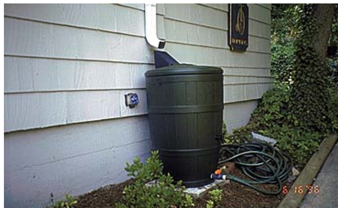
Rain barrels are appropriate for residential settings.

A nonprofit organization that provides technical tools for protecting water resources to local governments, activists, and watershed organizations. The Center has developed a number of excellent publications pertaining to site design and watershed protection.