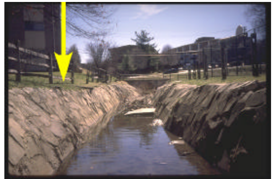
Poor Range (MD Save Our Streams) (arrow pointing to channelized streambank with no vegetative cover)