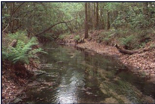
Optimal Range (Peggy Morgan, FL DEP)