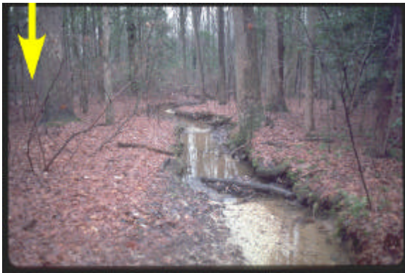
Optimal Range (arrow emphasizing an undisturbed riparian zone)