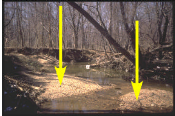
Poor Range (arrows pointing to sediment deposition)