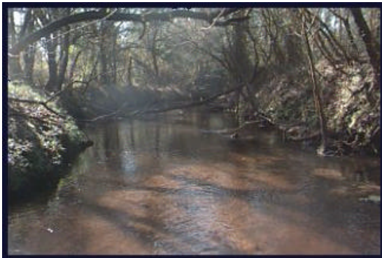
Optimal Range (Peggy Morgan, FL DEP)