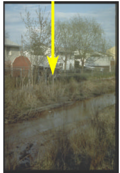
Poor Range (MD Save Our Streams) (arrow emphasizing lack of riparian zone)