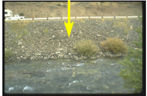
Poor Range (arrow pointing out lack of riparian zone)