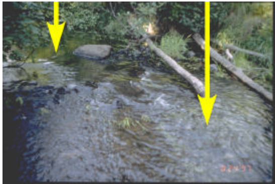
Optimal Range (Mary Kay Corazalla, U. of Minn.) (arrows emphasize different velocity/depth regimes)