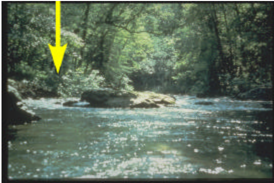
Optimal Range (arrow pointing to streambank with high level of vegetative cover)