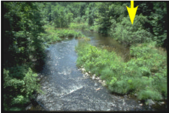
Optimal Range (arrow pointing out an undisturbed riparian zone)