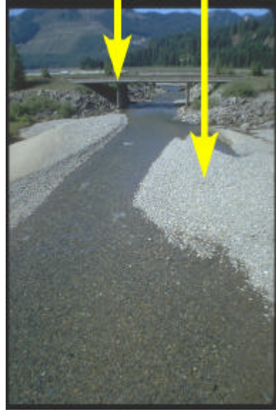
Poor Range (arrows emphasizing large-scale channel alterations)