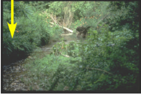
Optimal Range (arrow pointing to stable streambanks)