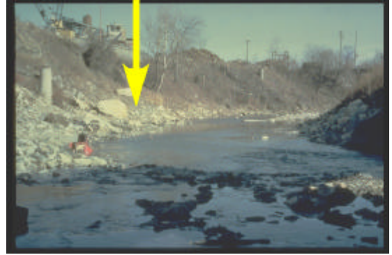
Poor Range (MD Save Our Streams) (arrow highlighting unstable streambanks)