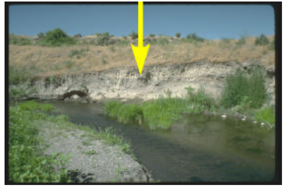
Poor Range (arrow highlighting unstable streambanks)