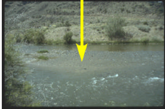
Poor Range (arrow pointing to sediment deposition)