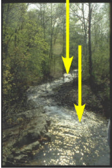
Optimal Range (arrows showing frequency of riffles and bends)