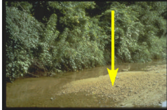
Poor Range (arrow showing that water is not reaching both banks; leaving much of channel uncovered)