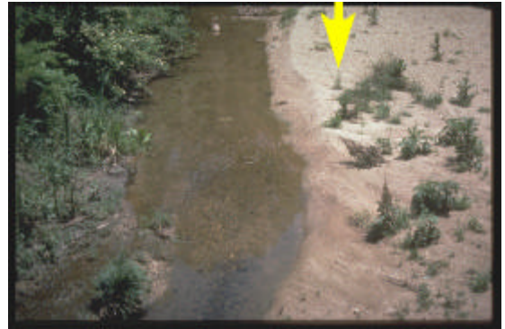
Poor Range (arrow pointing to streambank with almost no vegetative cover)