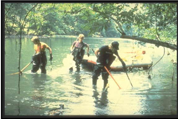
Tote barge (pram unit) Electrofishing

The safety of all personnel and the quality of the data is assured through the adequate education, training, and experience of all members of the fish collection team. At least 1 biologist with training and experience in electrofishing techniques and fish taxonomy must be involved in each sampling event. Laboratory analyses are conducted and/or supervised by a fisheries professional trained in fish taxonomy. Quality assurance and quality control must be a continuous process in fisheries monitoring and assessment, and must include all program aspects (i.e., field sampling, habitat measurement, laboratory processing, and data recording).