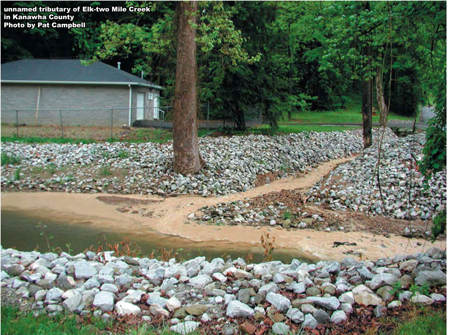
unnamed tributary of Elk-two Mile Creek in Kanawha County