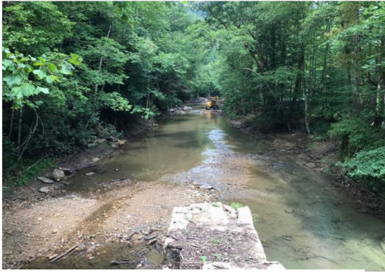
Buffalo Creek, Clay County before Restoration

The projects support regional conservation initiatives and enhance stream health by improving water quality and fostering biodiversity through habitat restoration.