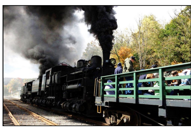
The 2014 Youth Environmental Conference at Snowshoe included a stop at Cass and a train ride to Bald Knob.

The conference is open to youth, ages 13-18, who are members of the state Youth Environmental Program. The deadline to register for the conference is 3