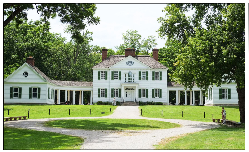
The Blennerhassett Island mansion is one of several stops during this year's Youth Environmental Conference. Visits to the Oil and Gas Museum and the Ohio River Islands Wildlife Refuge are also on tap.

WV Department of Environmental Protection (www.dep.wv.gov)