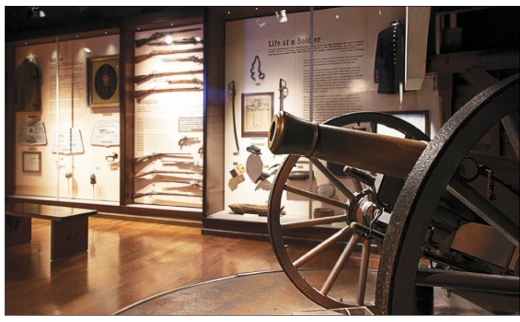
The West Virginia State Museum was renovated in 2009 and is a must-see for any West Virginian.