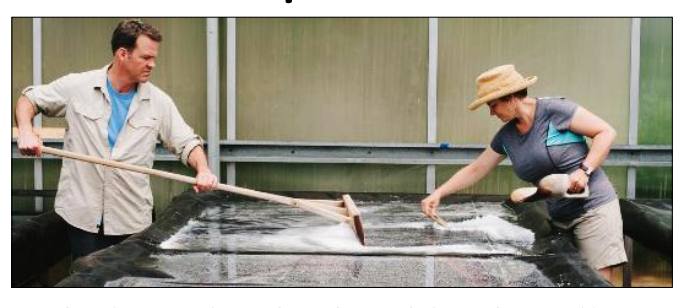
Workers harvest salt at J.Q. Dickinson Salt Works in Malden.

The conference gets underway at 4 p.m., Friday, Oct. 12 with environmental activities and a youth group project idea