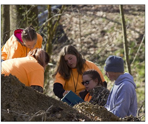
Students test their knowledge in wildlife, soils, forestry and aquatics at the state Envirothon event.