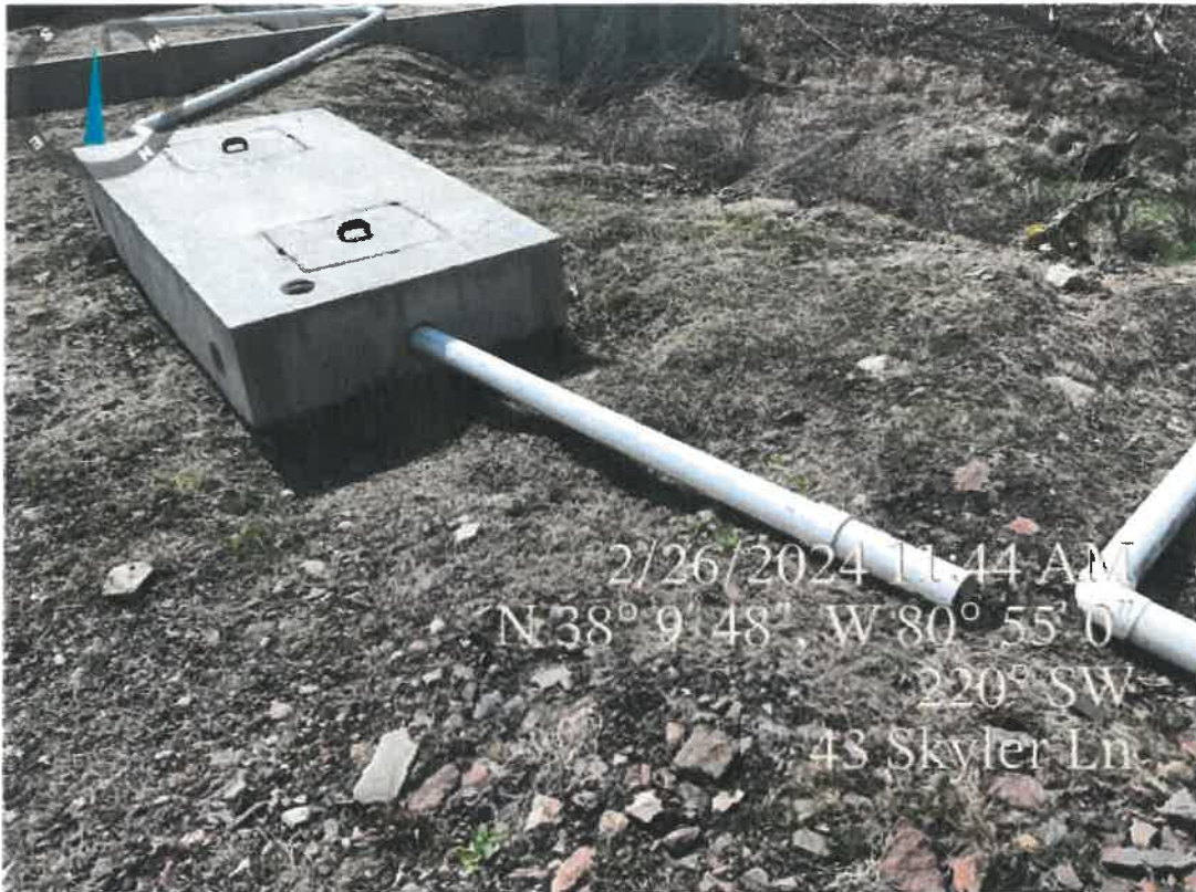
Sand filters not in use

Mt. Lookout MHP - WV0103110/WVG550263 - Consent Order - Nicholas County