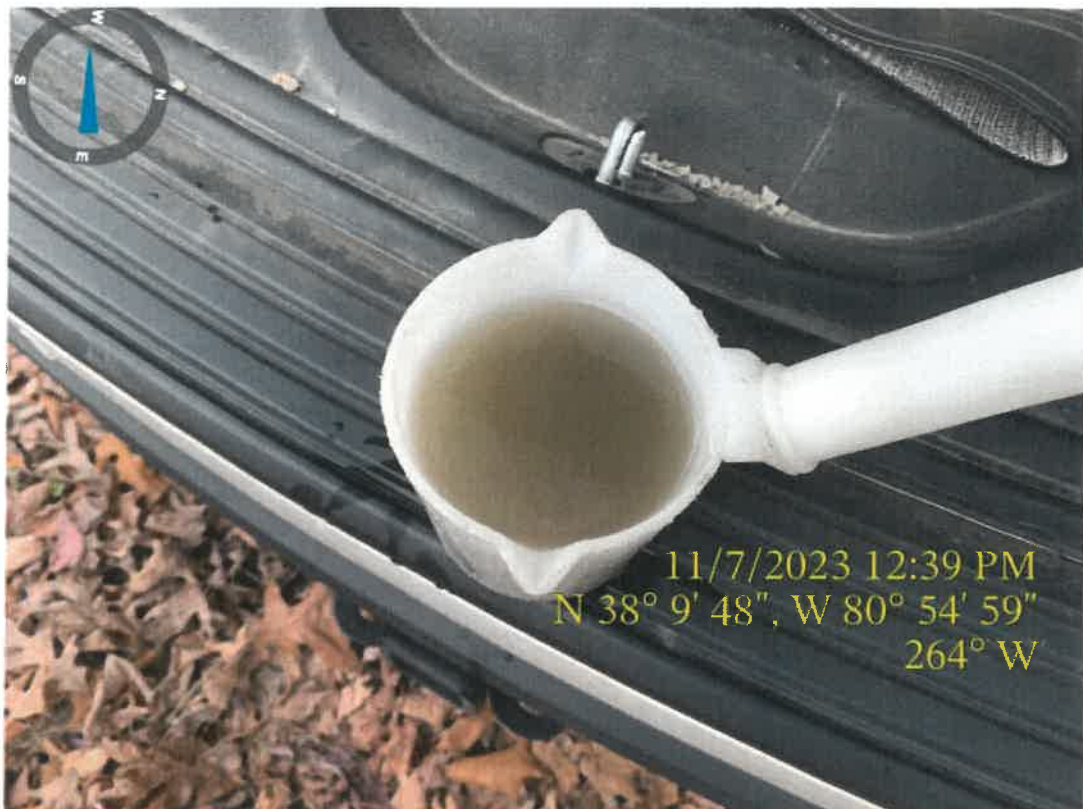
Turbid effluent discharging from Outlet 001

Mt. Lookout MHP - WV0103110/WVG550263 - Consent Order - Nicholas County