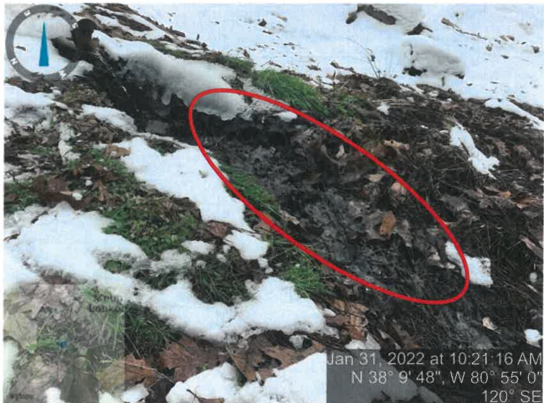
Solids below Outlet 001