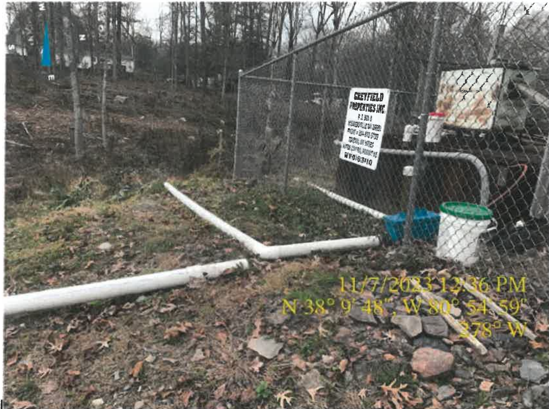
Discharge diverted from the sand filters

Mt. Lookout MHP - WV0103110/WVG550263 - Consent Order - Nicholas County