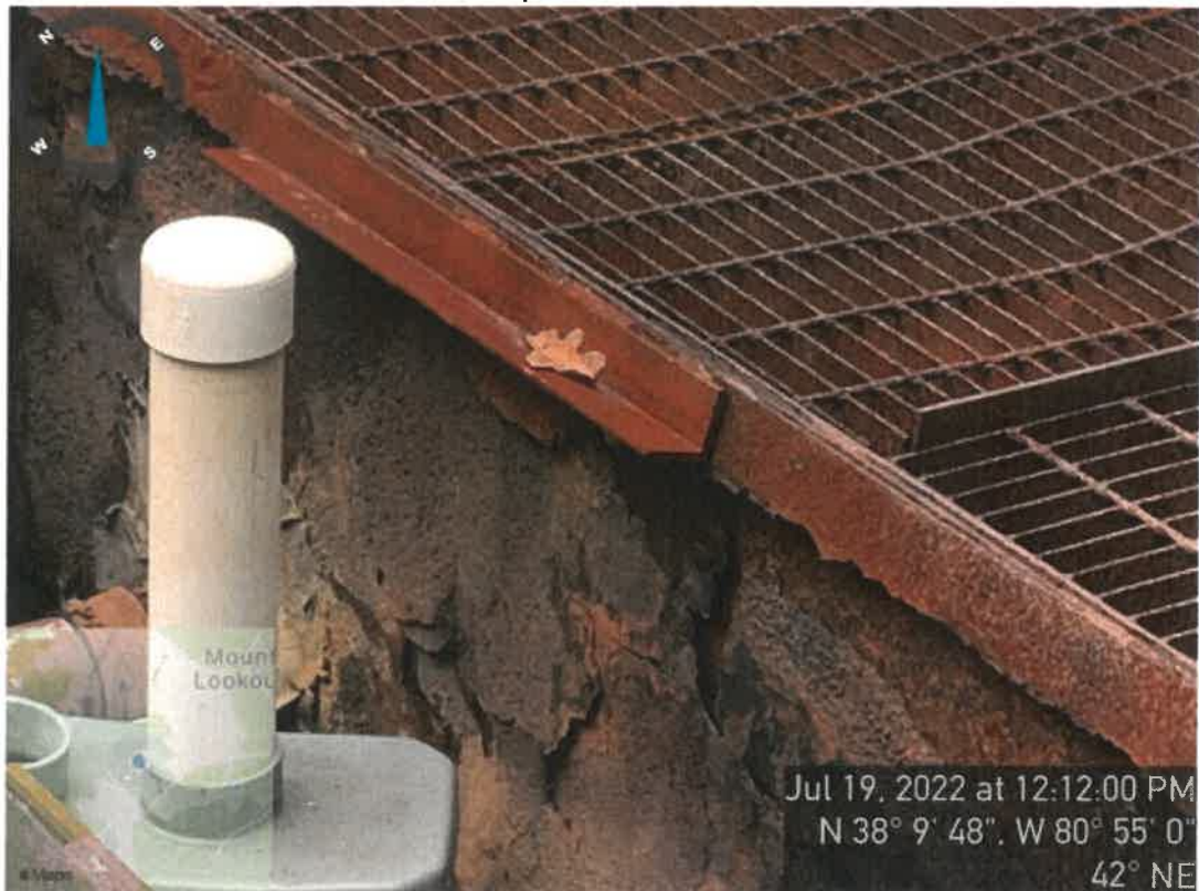
Corrosion near the inlet of the chlorine contact chamber