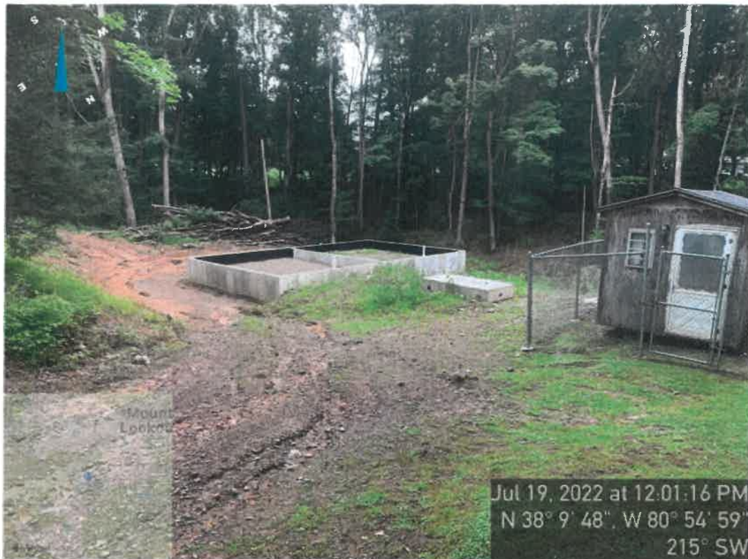
Dosing/pump tank and sand filters

Mt. Lookout MHP - WV0103110/WVG550263 - Consent Order - Nicholas County