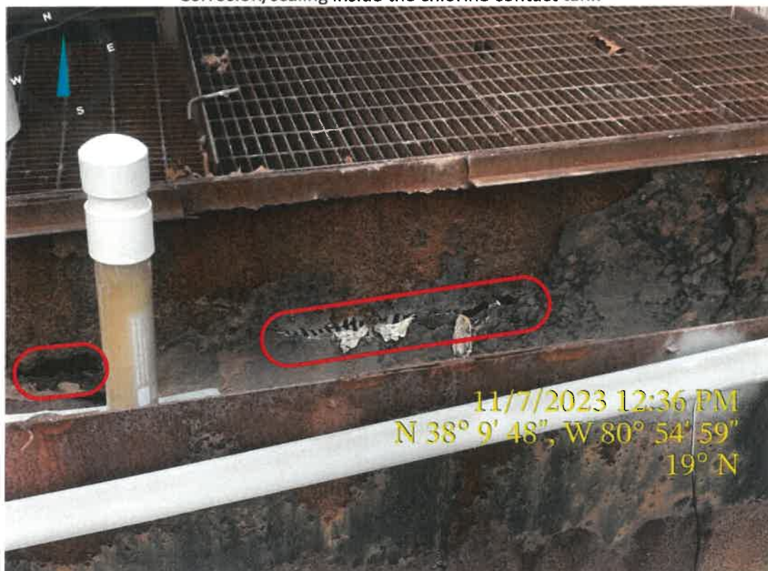
Corrosion in clarifier/contact tank wall