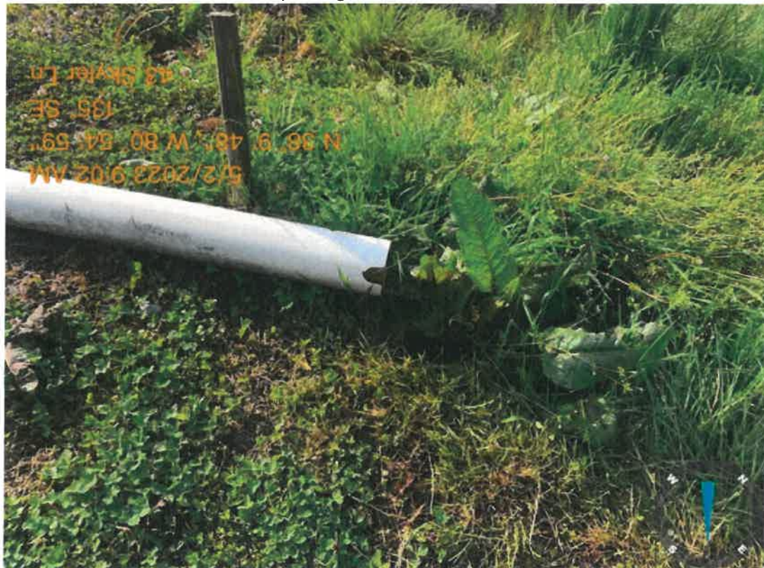
Discharge prior to entering the sand filters