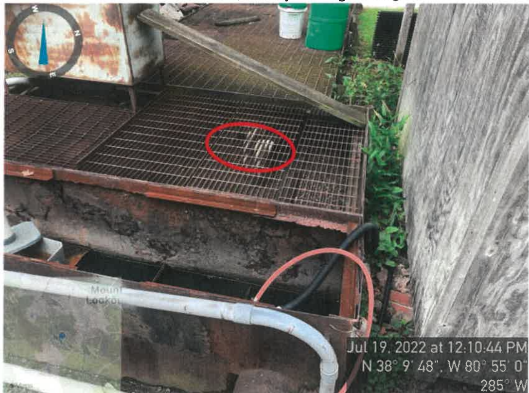
Solids observed on the surface of the clarifier, corrosion in the chlorine contact chamber