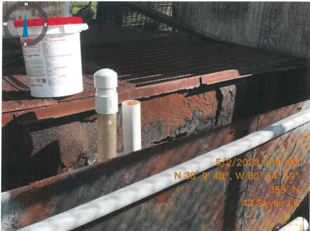
Corrosion and scaling in the chlorine contact tank

Mt. Lookout MHP - WV0103110/WVG550263 - Consent Order - Nicholas County