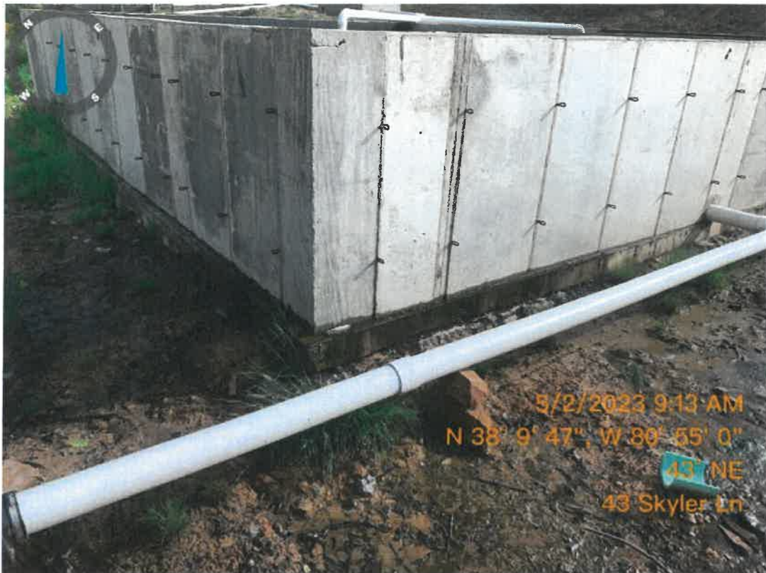
Seepage around the base of the sand filters

Mt. Lookout MHP - WV0103110/WVG550263 - Consent Order - Nicholas County