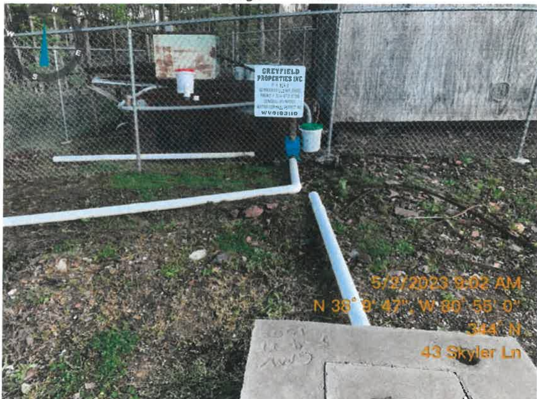
Flow is not diverted into the settling tank/sand filters