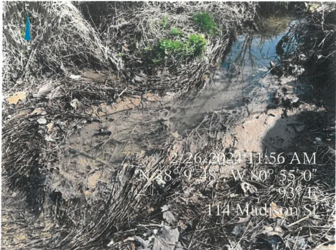
Solids entering the receiving stream from the sewage treatment unit

Mt. Lookout MHP - WV0103110/WVG550263 - Consent Order - Nicholas County