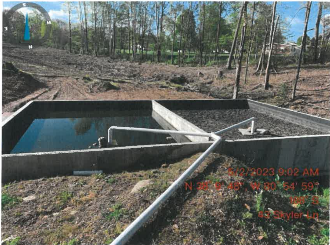
One side of the filter is pooling water, and solids are on the other filter

Mt. Lookout MHP - WV0103110/WVG550263 - Consent Order - Nicholas County