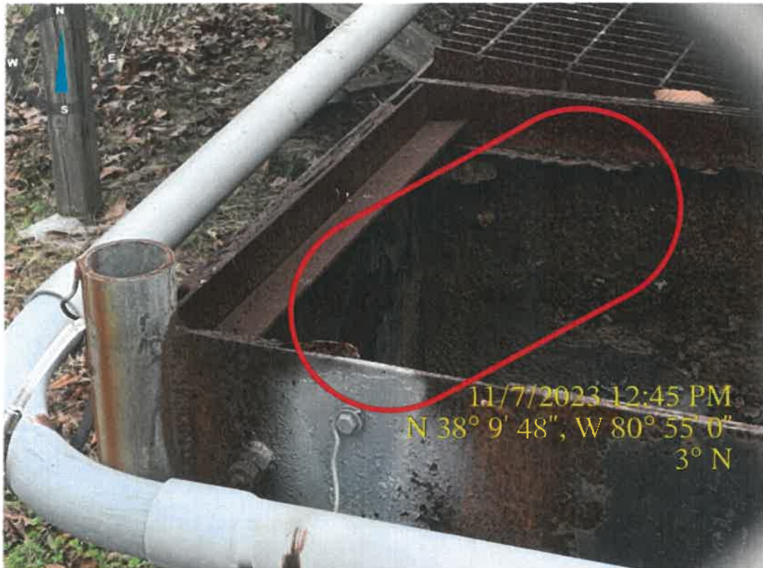
Corrosion/scaling inside the chlorine contact tank

Mt. Lookout MHP - WV0103110/WVG550263 - Consent Order - Nicholas County