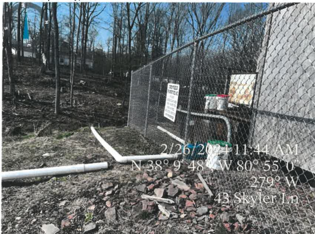
Discharge without tertiary treatment