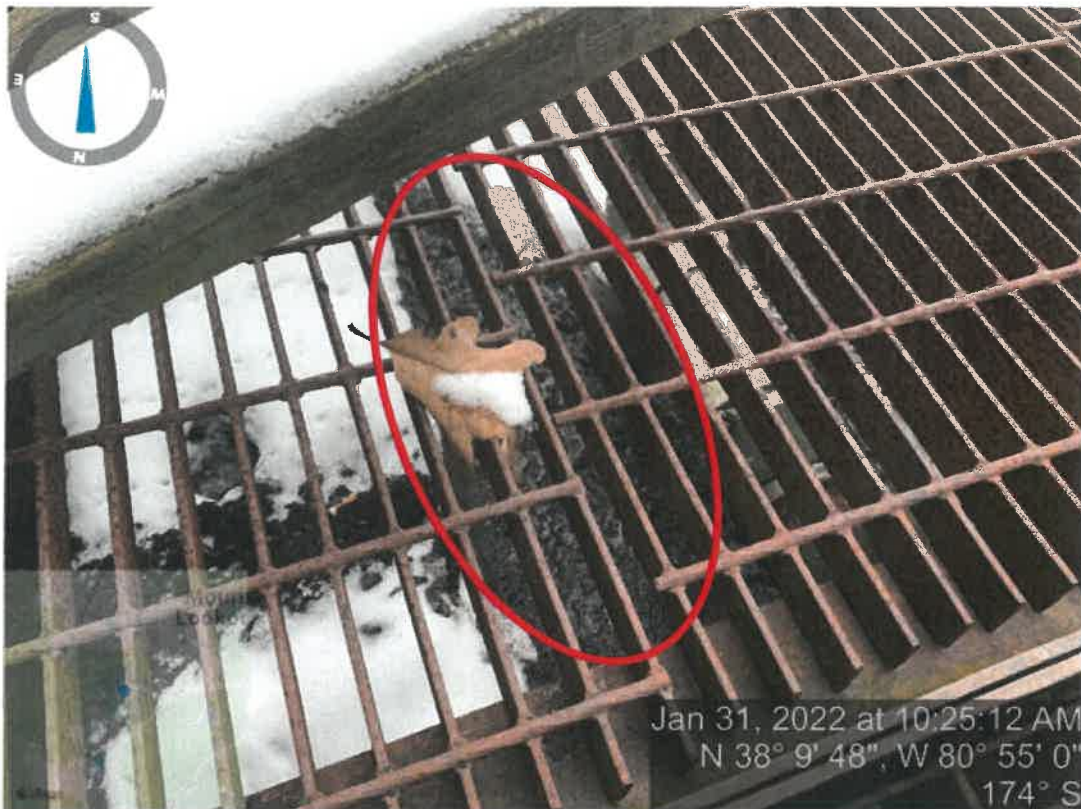
Solids in the clarifier

Mt. Lookout MHP - WV0103110/WVG550263 - Consent Order - Nicholas County