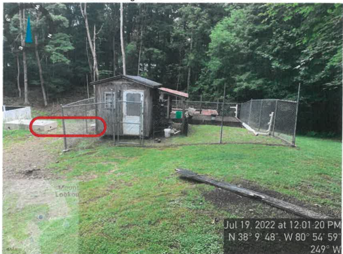
Treatment plant - sand filters not connected