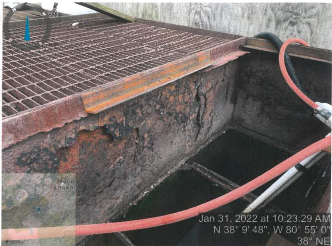
Corrosion/Scaling inside the chlorine contact chamber

Mt. Lookout MHP - WV0103110/WVG550263 - Consent Order - Nicholas County