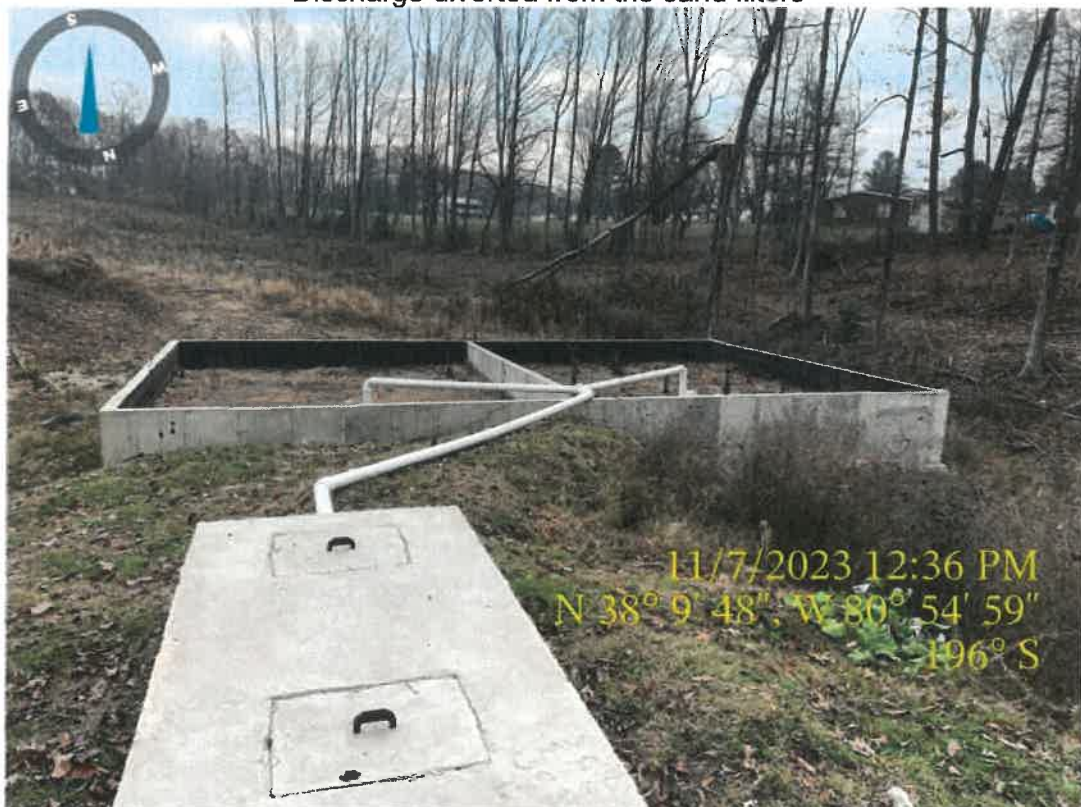
Sand filters covered with vegetation