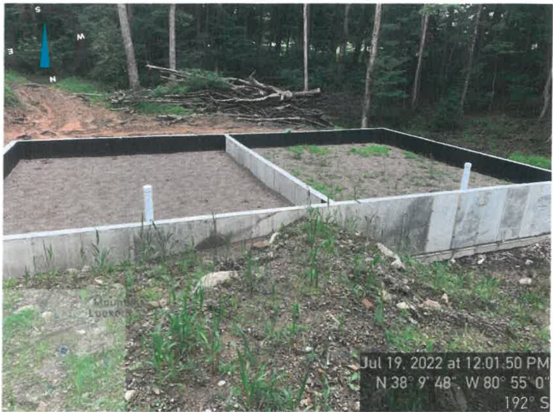
Sand filters not in use, already has vegetative growth

Mt. Lookout MHP - WV0103110/WVG550263 - Consent Order - Nicholas County