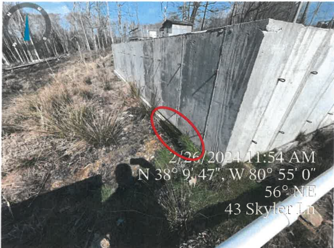
One of multiple locations where the seam on the sand filters appears to be seeping

Mt. Lookout MHP - WV0103110/WVG550263 - Consent Order - Nicholas County