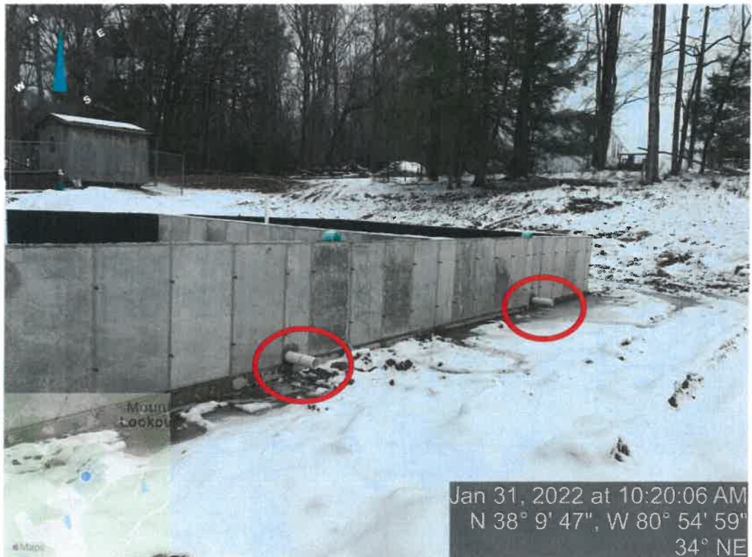
Outlets of the sand filters