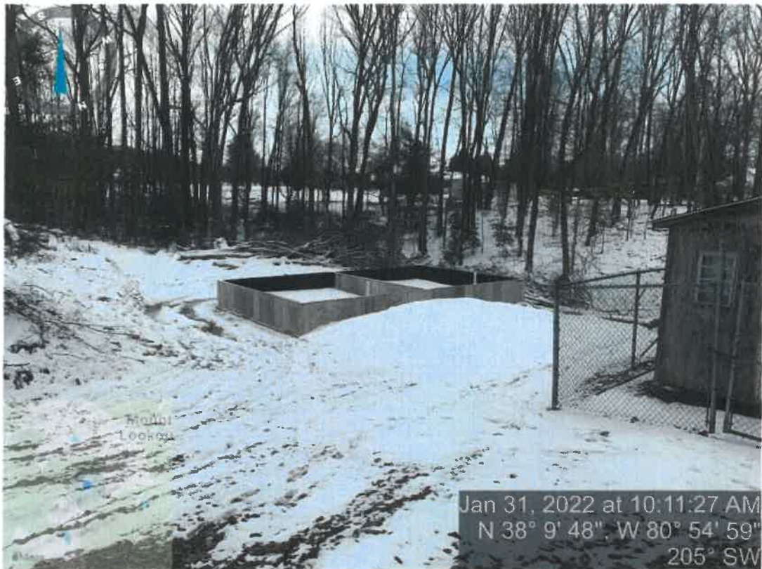
Sand filters not in service

Mt. Lookout MHP - WV0103110/WVG550263 - Consent Order - Nicholas County