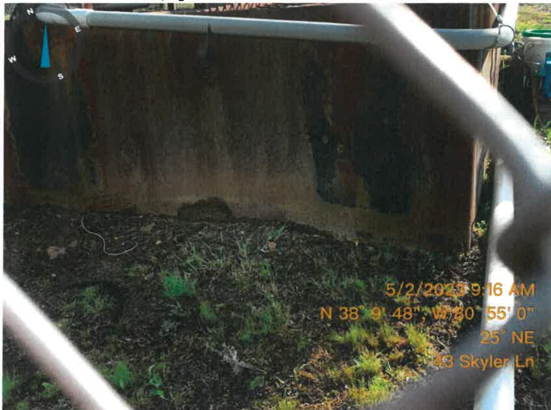
Corrosion observed around the base of the tank