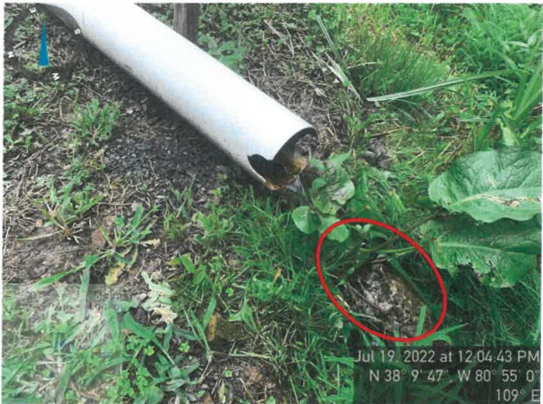
Solids deposited at Outlet 001

Mt. Lookout MHP - WV0103110/WVG550263 - Consent Order - Nicholas County