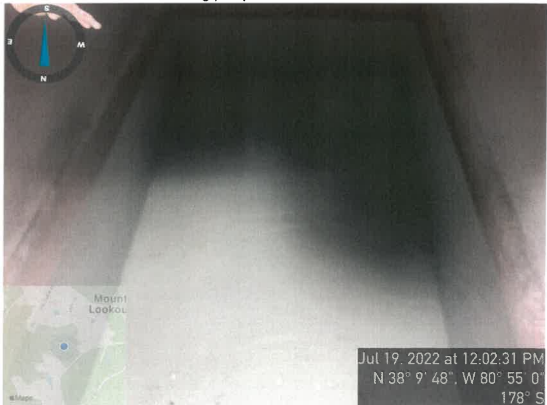
Dosing tank with no pump