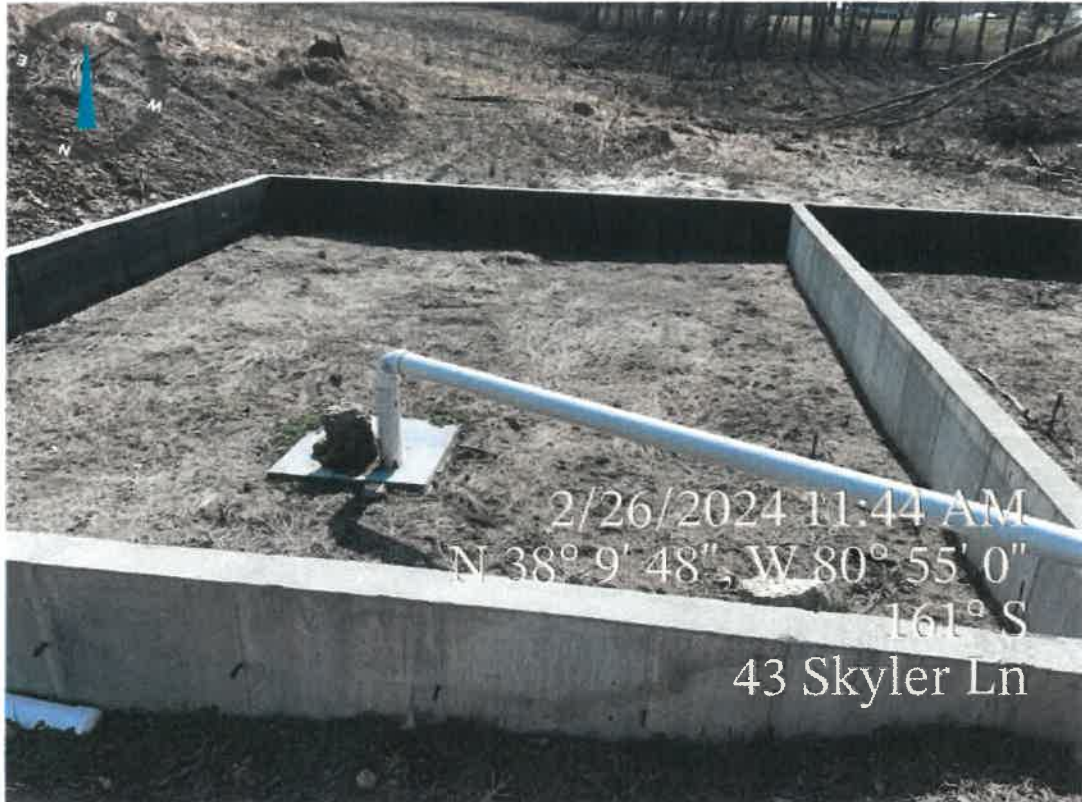
Vegetative growth on sand filters