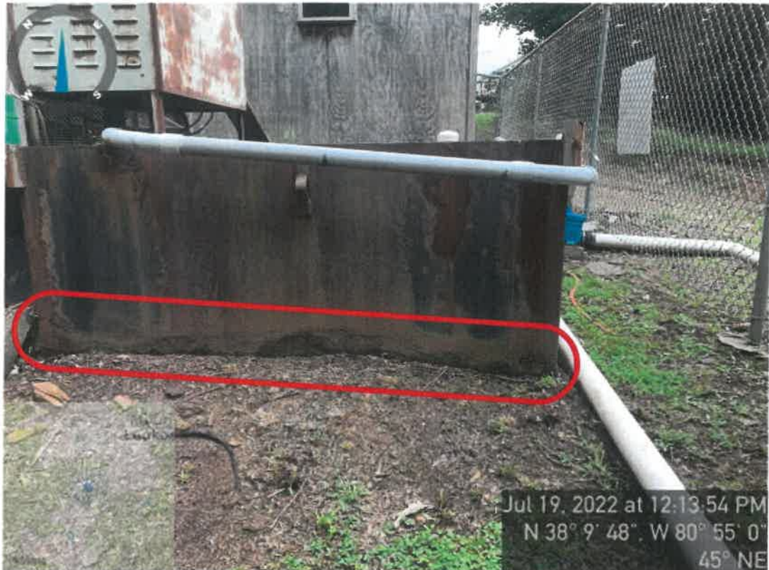
Corrosion along the ground level of the clarifier/chlorine contact chamber

Mt. Lookout MHP - WV0103110/WVG550263 - Consent Order - Nicholas County