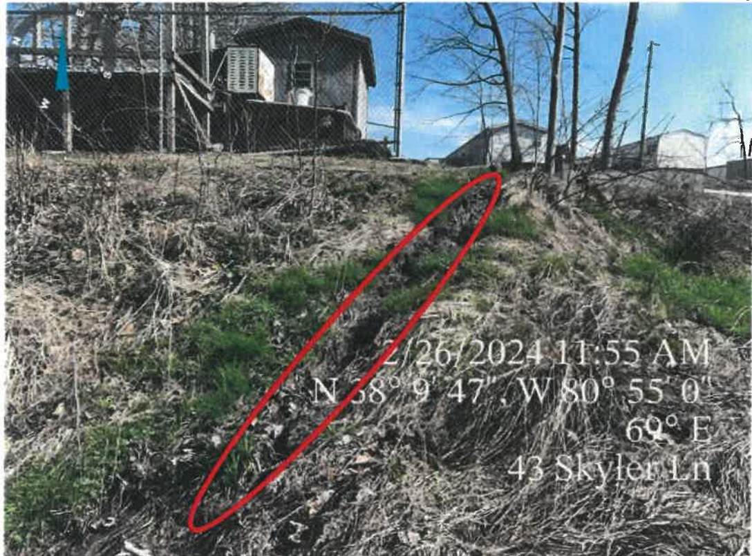
Discharge point - solids deposited between pipe and receiving stream