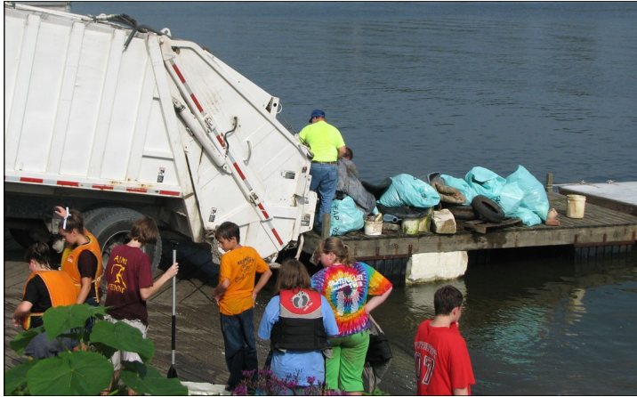
Volunteers removed over 150 tons of litter and 5,300 tires in 2009.