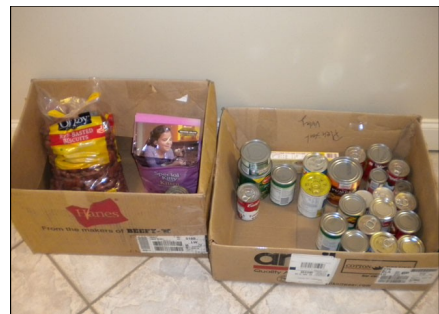
Boxes in the DEP's Fairmont office are expected to fill up by Feb. 11 with donations to a local homeless shelter and the Marion County Humane Society.