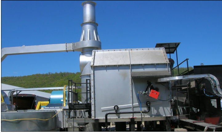
This gasifier at the Frye Poultry Farm in Hardy County converts chicken litter into fuel for heating poultry houses. It supplants costly propane, which produces wet heat and high levels of ammonia.