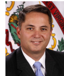
Message from the cabinet secretary

It doesn't seem that long ago when there were only two or three computers around the office. You had to shoulder your way into a work station to use one, or wait your turn. Eventually, computers became essential for us to do our jobs.